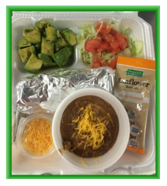
Lunch Program: $3.50

Free/Reduced eligible students: receive breakfast/lunch at free or reduced rates. Please fill out the Application for Free and Reduced-Priced meals and see below for more information on how to apply.